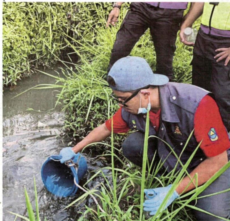
A Selangor Water Management Authority (Luas) employee taking water samples near the Sungai Gong industrial area for testing yesterday.