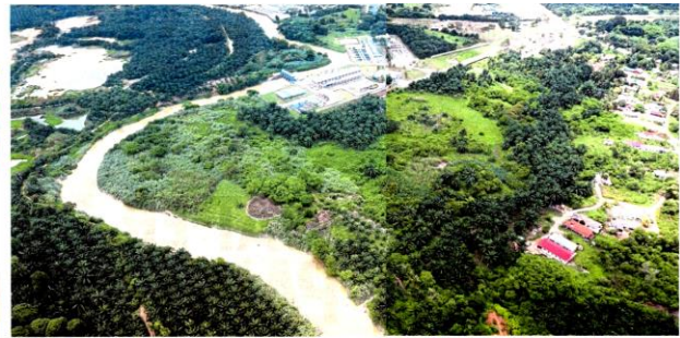
An aerial view of Selangor's four water treatment plants had to be shut down following the discovery of pollution in the river.