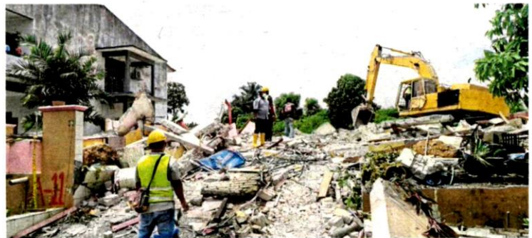
Jentolak merobohkan kediaman penduduk di tepi Sungai Pelepas, Desa Subang Perantau, Shah Alam.

keluarkan, kami banyak kali buat rayuan termasuk kepada Sultan Selangor dan Menteri Besar serta Kementerian Air, Tanah dan Sumber Asli, tetapi tidak berhasil.