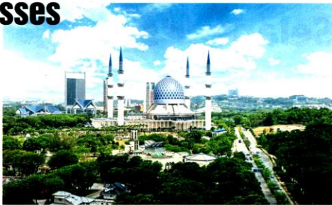
ABOVE The Sultan Salahuddin Abdul Aziz Shah Mosque in Shah Alam is the highest mosque in the country and second largest in Southeast Asia.

Land of opportunity The state's growth exceeded the national gross domestic product (GDP) of 4.3% last year. Selangor's economy grew at the fastest pace of 6.7% among all the