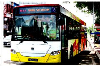
ABOVE Smart Selangor bus service

A fleet of private bus operators also serves the last mile connectivity. Public transit is further boosted by the state government's free bus service called Bus Smart Selangor or Bus Selangorku and is managed by the major municipalities. Combined with a vast network of major interstate and interstate highways, the public transportation infrastructure alleviates the growing pains of urbanisation and an increasing population.