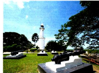
BELOW Shah Mohamad, Kuala Selangor

as air conditioning, kitchen and dressing cabinets, glass water heaters. Concurrently, the Project Rumah Islamiah by Selangor's Menteri Besar Incorporated (MBI) will also bolster affordable homes in the state. The project targets the B40 and M40 groups and aims to build 48,000 units within five years with an economic value of RM 12bn.