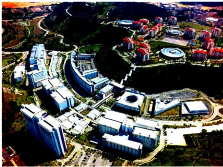
Aerial view of the SIRIM campus in Putrajaya, Selangor.

Yeah said Selangor also registers the highest proportion of the country's 120 and M40 households, with 37.1% for the former and 25.2% for the latter in 2019. By comparison, Pulau Pinang, which has the highest per capita income of the 13 states, accounts for only 5.8% (720) and 7.2% (M40) respectively. As the largest state economy with the largest pool of high and middle-income households, Yeah said Selangor would likely be among the few rich states to lead the country's recovery from the pandemic-induced economic downturn.